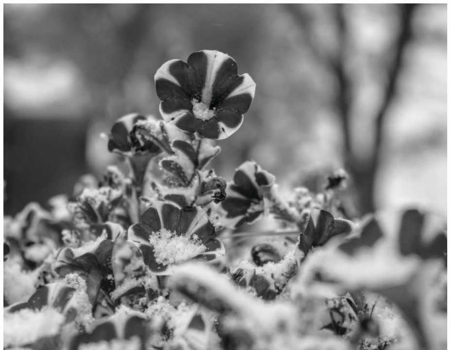
The Chase

The Chase welcomes letters to the editor or guest columns from all members of the Eastern New Mexico University community. Submissions must include the author's name, email, and phone number for purposes of identification. Contact information will not be published. The Chase does not publish anonymous letters or letters that are promotional in nature. The Chase reserves the right to edit letters and guest columns for length, clarity, and style, as well as the right to withhold letters based on the discretion of the editors. Letters to the editor and guest columns express the opinions of their authors and do not necessarily reflect the views of this publication. It is our belief that under the First Amendment, writers have the right to voice unpopular opinions and the privilege to either agree or disagree with the majority. Letters to the editor and guest contributions help preserve the right of students at this university to discuss and challenge what oftentimes can be disliked.