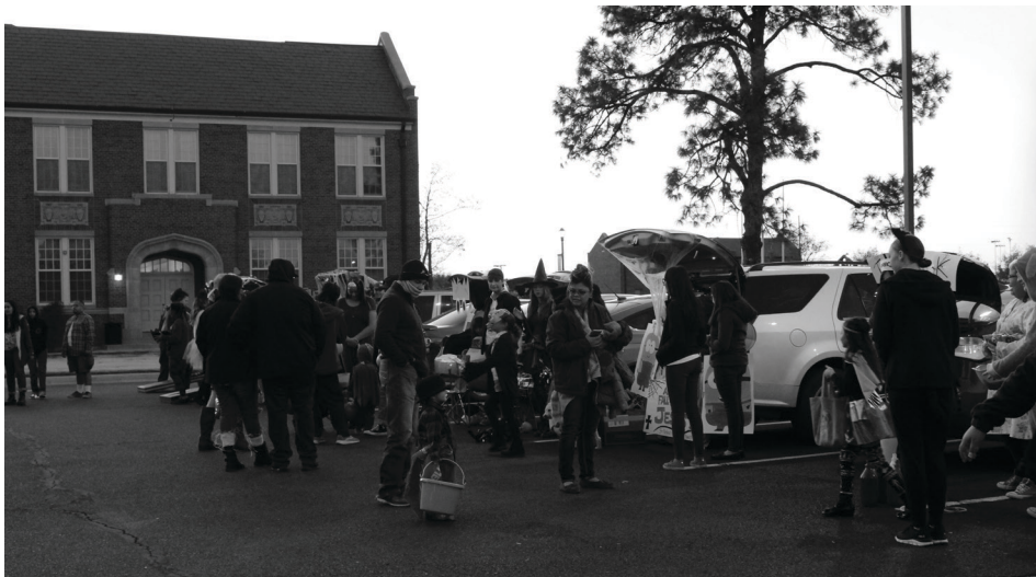
Students and volunteers decorating their vehicles and handing out candy during Trunk-or-Treat at ENMU outside Curry Hall

A mother of a “trick or treater” at the event said that it was a great way for her kids to trick or treat in a safe environment. “I’d rather bring my kids here and know that they are safe and having fun than [take] them somewhere else.” She added that she appreciates the college putting on this event.